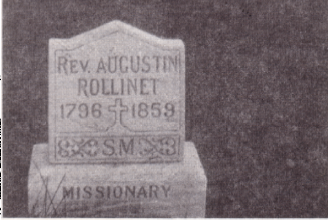
Diocese of Columbus